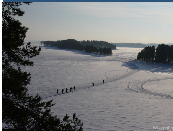
Ski tracks on frozen lake